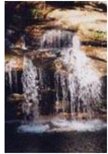
Table Rock. The views were breath taking, as was the climb! It felt as if it was straight up, and we rested a good bit going up. We decided we would have to go back and try it again, soon!

In November, Lee and I joined two friends, Darrin and Michelle, for a camping trip. It was my first time camping, and I really loved it. We went to a campsite near Table Rock and had roasted marshmallows, hot dogs, and a delicious banana/chocolate/marshmallow dessert. We also hiked half way up to